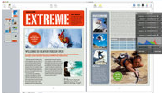
Apple Pages being used with one of the free templates

Desktop publishing (also known as DTP ) combines a personal computer, page layout software and a printer to create publications on a small economic scale. Users create page layouts with text, graphics, photos and other visual elements using desktop publishing software such as QuarkXPress, Adobe InDesign, the free Scribus, Microsoft Publisher, or Apple Pages. For small jobs a few copies of a publication might be printed on a local printer. For larger jobs a computer file can be sent to a vendor for high-volume printing.