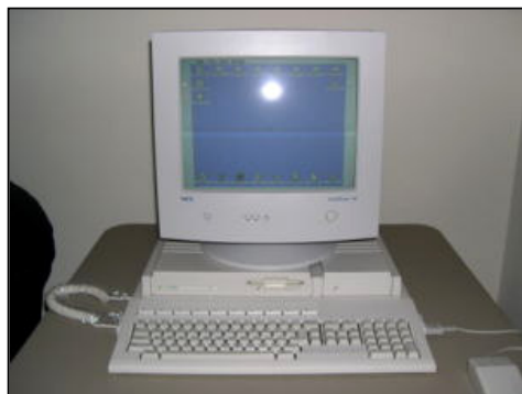
The Atari TT030